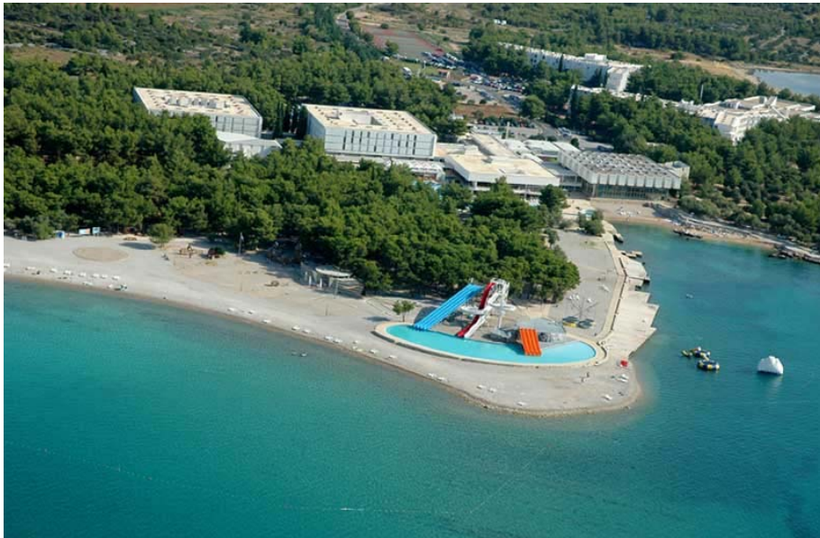
The Hotel – Tourist Colony “Solaris”